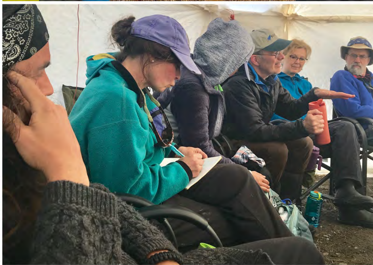
Day 8: Innavait Creek: Wyoming snow gauge, point-quadrat sampling method; dinner at Happy Valley camp; literature discussion group.