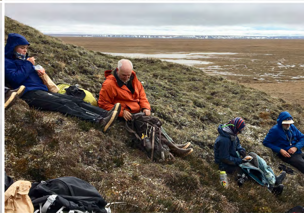
Day 10: Hike to Percy Pingo; grizzly bear winter den and print; lunch on Percy with Franklin Bluffs in background.