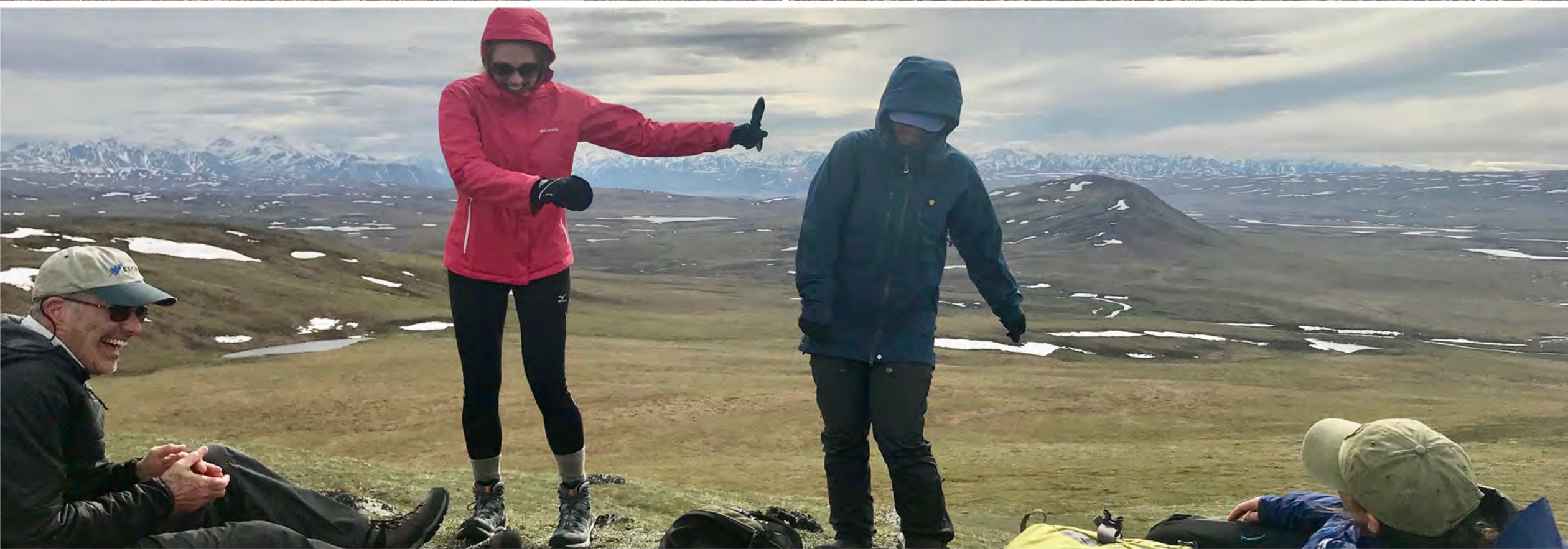
Day 7: Toolik Field Station: Experimental research sites; tundra plant communities; Jade Mountain summit dance.