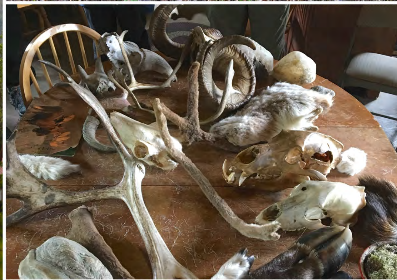
Day 2, Wiseman; attack cat sign; arctic wildlife skulls, horns, antlers, and bones during lecture by Jack Reakoff, local wildlife expert.