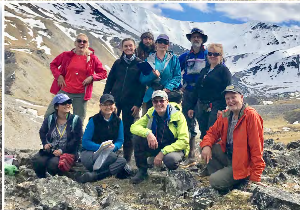
Day 5: Atigun Pass, lobate rock glacier.