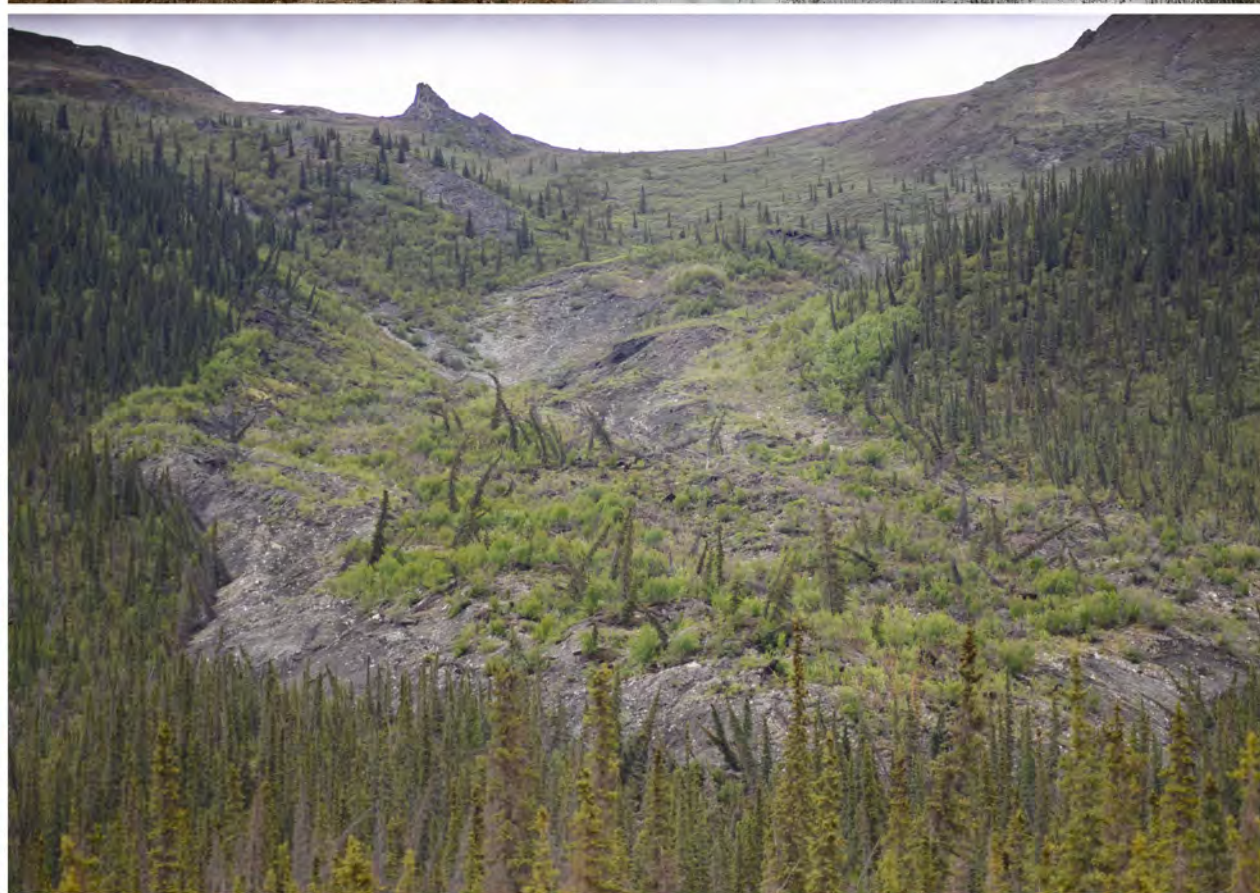
Day 3, Sukakpak Mountain; fen, ice-cored mounds, and thermokarst; adding to plant collections; frozen debris lobe (a slow-moving landslide).