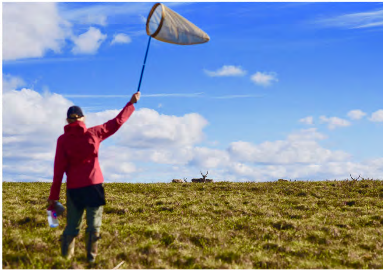
Day 9: Happy Valley camp: collecting insects and plants; waving to caribou.