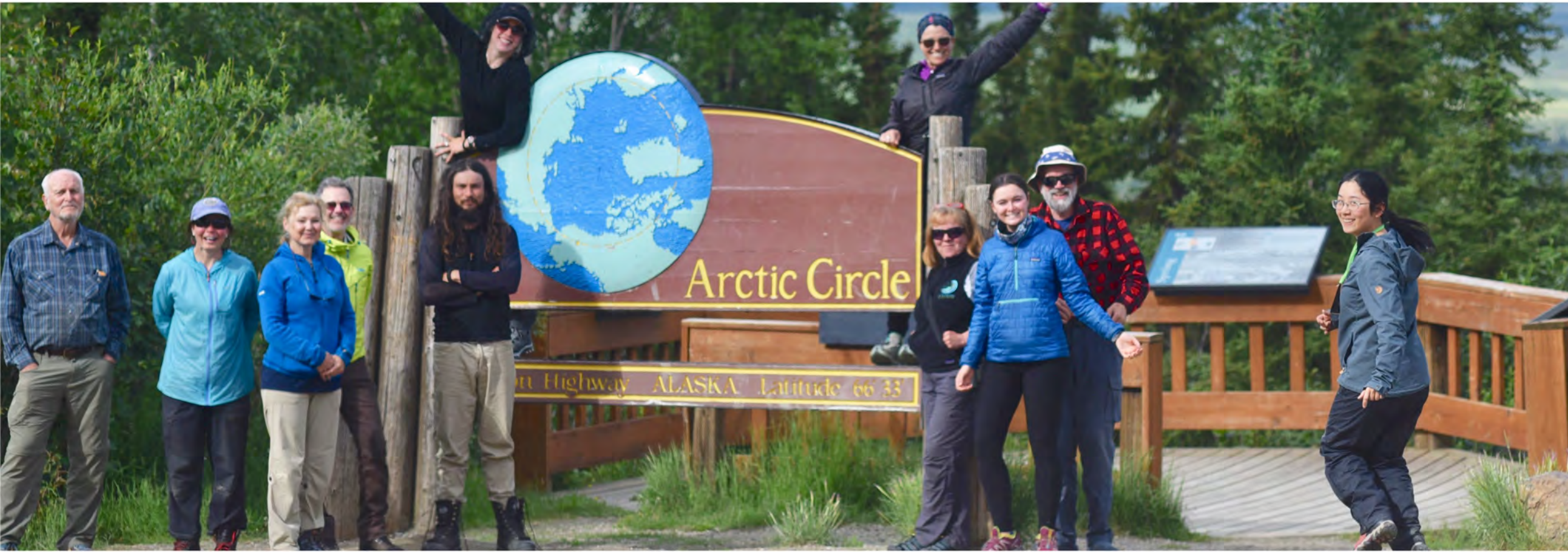
Days 11, 12, 13, & 14:: Prudhoe Bay oilfield tour; frozen Arctic Ocean; driftwood from the Mackenzie River, Canada; alpine hike towards Grizzly Glacier; long ride to Fairbanks on the return trip, Arctic Circle. Back cover: UAF West Ridge research buildings.