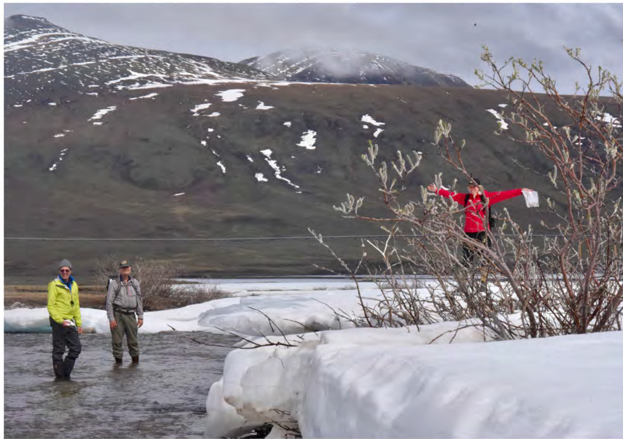
Day 4, Galbraith Lake camp and river icing.