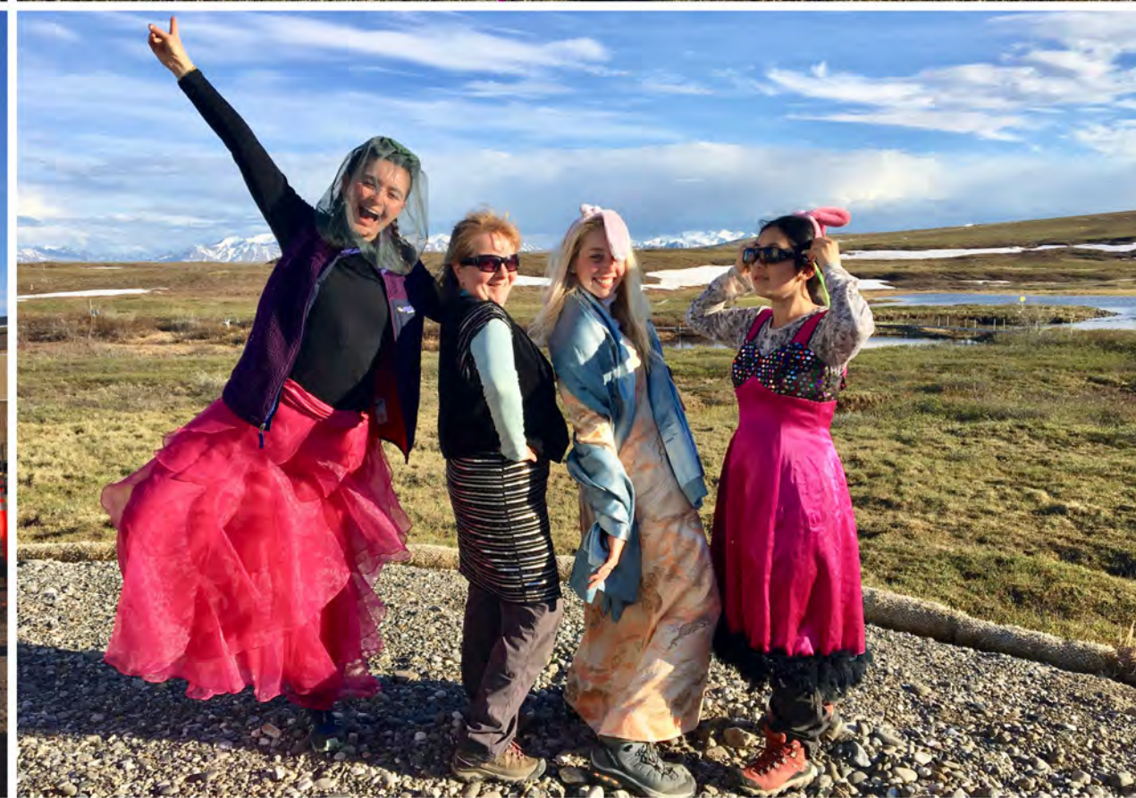
Day 6: Galbraith Lake camp; plant community and soil sampling along river terraces; summer solstice celebration at Toolilk Lake.